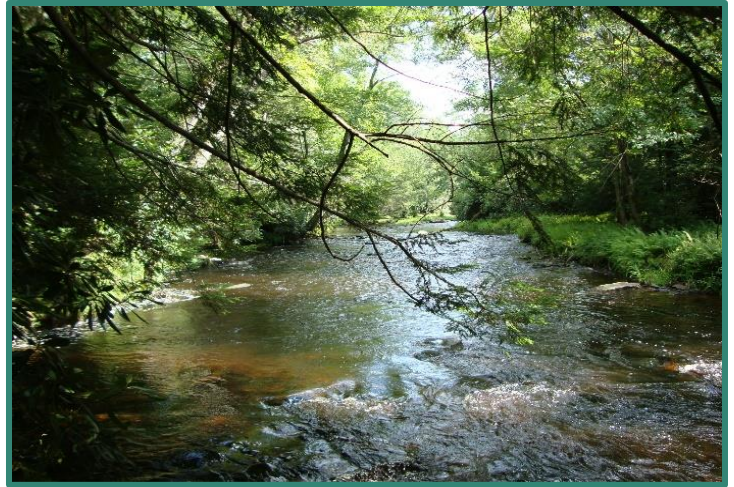
"The Stretch" is part of the Tunkhannock Creek, extending from the wire at Tunkhannock Fishing Association to the Route 80 Bridge